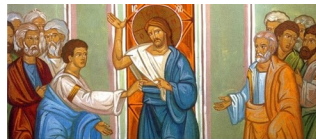
"Ooubt no longer but believe!"

Cemetery Devotion Dates See notice on parish website www.rahanparish.ie