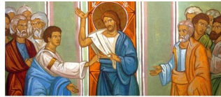
"Doubt no longer but believe!"

Killickfehan Cemetery Saturday 22nd August Mass at 6pm